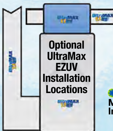
Typical residential air handler